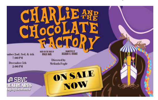
To hear Saige's interview on Lifestyles with Lillian Vasquez, visit KVCRnews.org/lifestyles.

December 2 - 4 at 7:00 p.m. December 5, 2021 at 2:00 p.m.